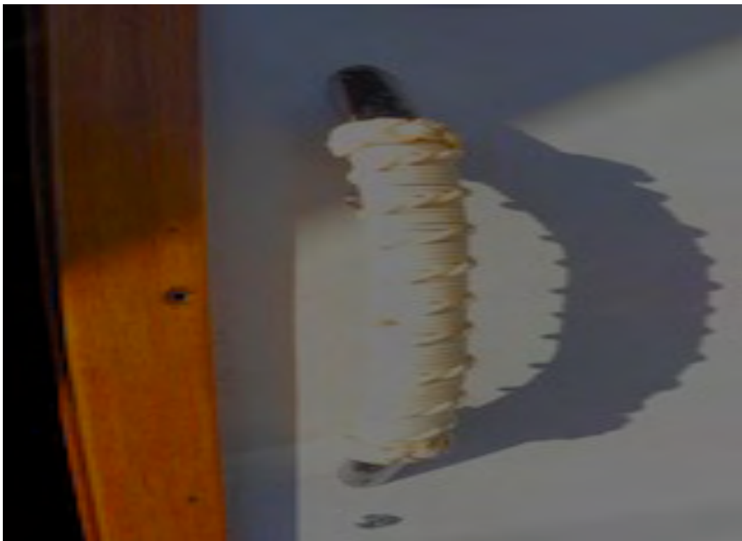
Port Side / Dodger and Custom Teak Visor