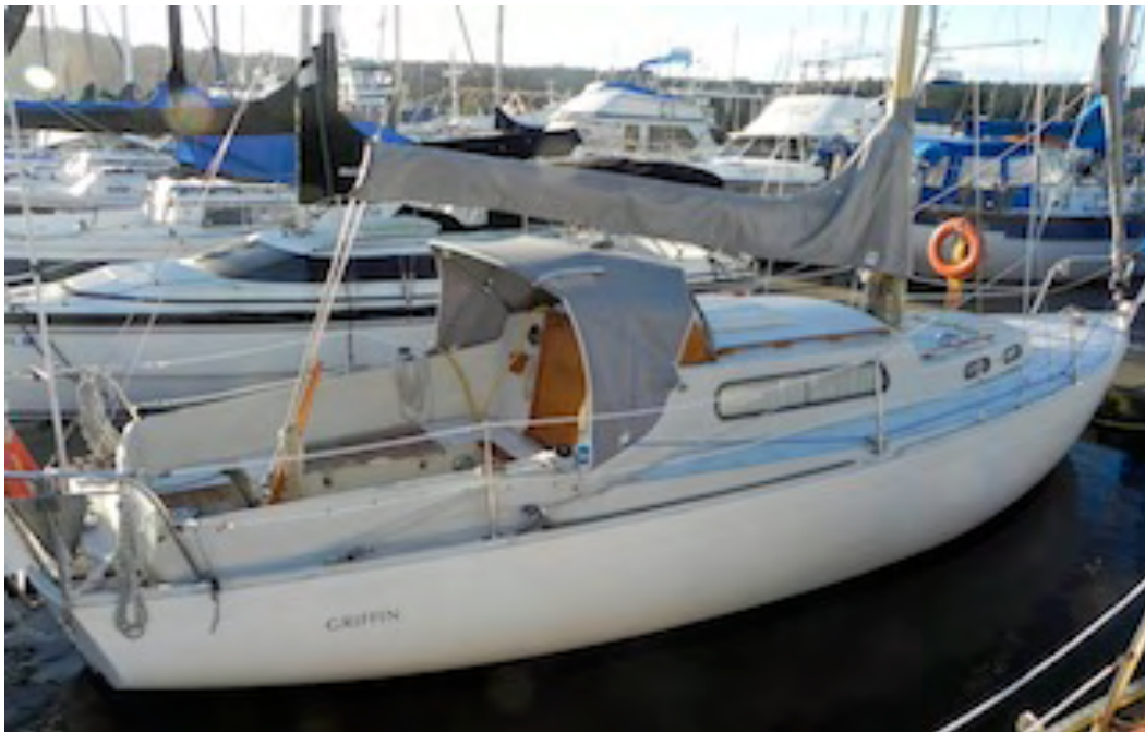
Deck and Hull Moisture Tested