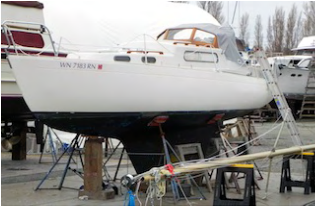
Replaced Cutlass Bearing / Prop Check / Spare Bearings