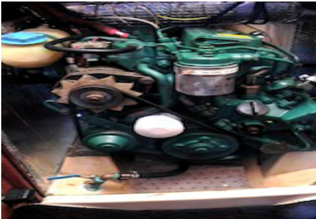
Reduction Gear / Shaft - Filters