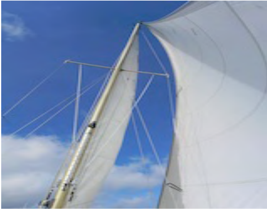
Sailing off Alki