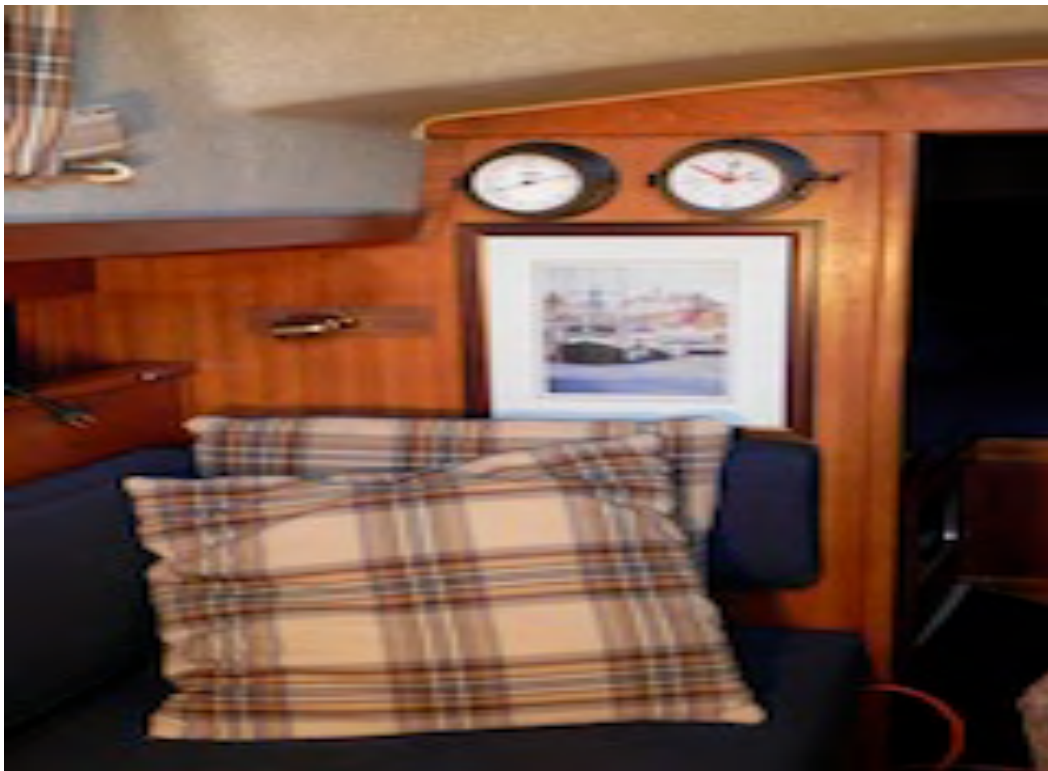
Head (New plumbing, valves, tankage, and lines throughout ... vent filter)