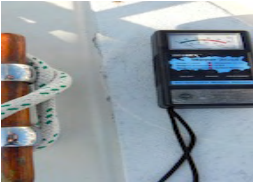
Sailing off Port Ludlow